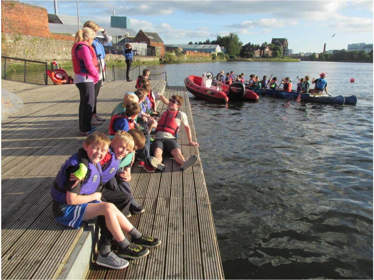
[It only looks as if the Cubs are about to push Bagherra in !!]