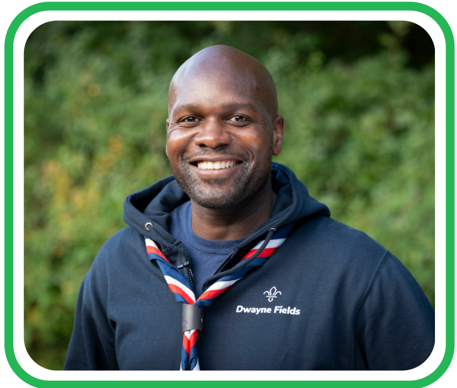
Dwayne Fields UK Chief Scout

I want a new generation to learn the skills, friendship and belonging I felt when I needed them most. I want to show that the outdoors is a place for all of us to be at our best, that Scouts is truly open to all.